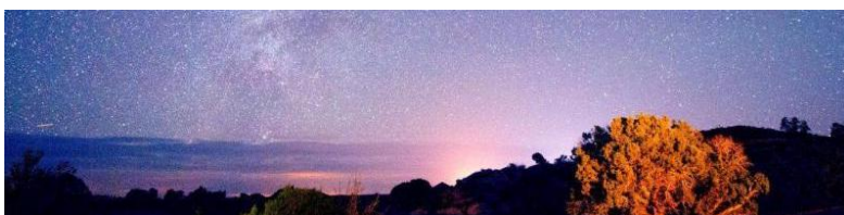
UFO WatchTower Cosmic Highway Conference July 28-30, 2017 Center, Colorado. www.ufowatchtowerevents.com